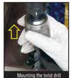
Mounting the twist drill