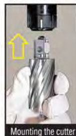
Mounting the cutter

Our original self-centering tool-less chuck is quick and easy to change cutters with little downtime.