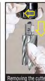
Removing the cutter