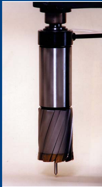
JETBROACH HOLDER OPTIONAL