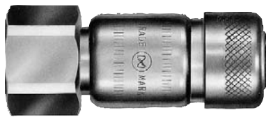
FOR REGULATOR CONNECTION (SF)