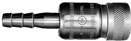
FOR HOSE CONNECTION (SH)