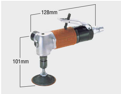
Model MAS-20B Abrasive disc 1", 1-1/2" & 2" OD